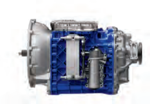
Volvo I-Shift - Overdrive